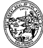
Edmund G. Brown Jr. Governor